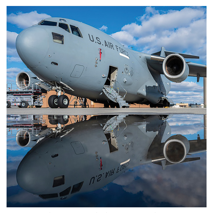
The appearance of U.S. Department of Defense (DOD) visual information does not simply or constitute DOD endorsement.